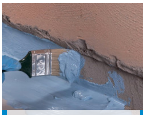
Application of Mapelastic AquaDefense Zero by brush between floor and wall before applying Mapeband