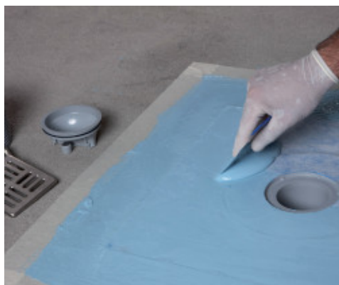
Impregnating Drain Vertical fabric with Mapelastic AquaDefense Zero

Grout tile joints with a special cementitious grout (such as Ultracolor Plus - class CG2WFA, Keracolor FF , Keracolor GG mixed with Fugolastic ) or epoxy grout (for example Kerapoxy , Kerapoxy Easy Design , or Kerapoxy CQ - class RG). Seal expansion joints with a special MAPEI sealant (such as Mapesil AC , Mapesil AC Eco , Mapesil LM , or Mapeflex PU 45 FT , according to requirements).