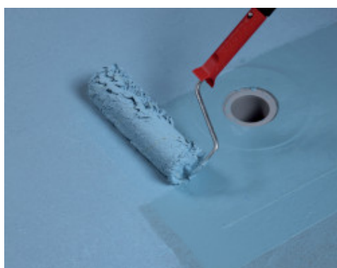
Application by roller of the second coat of Mapelastic AquaDefense Zero