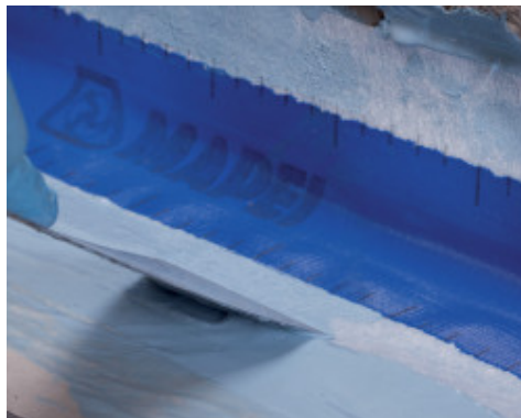
Application of Mapeband on a wall-floor fillet joint with Mapelastic AquaDefense Zero