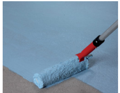
Application of the first coat of Mapelastic AquaDefense Zero on a screed